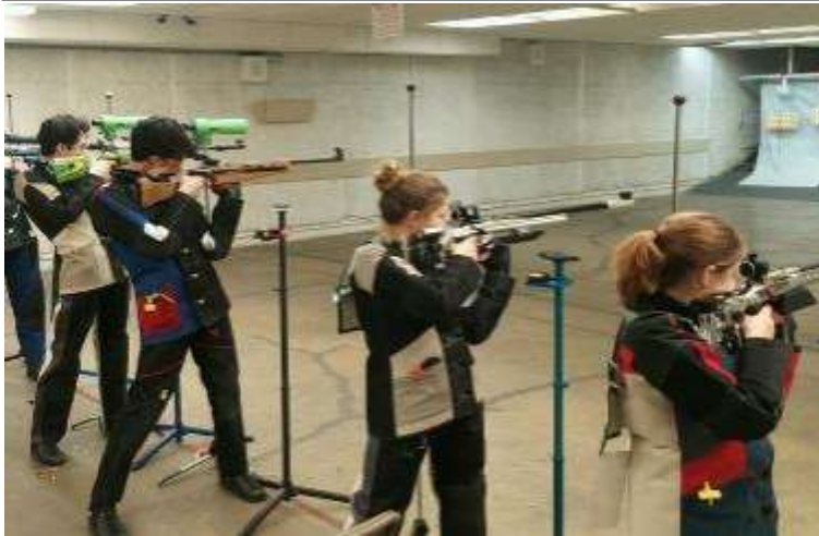
Junior Shooters at the NRA Junior Sectional held at the DSC Shooting standing smallbore